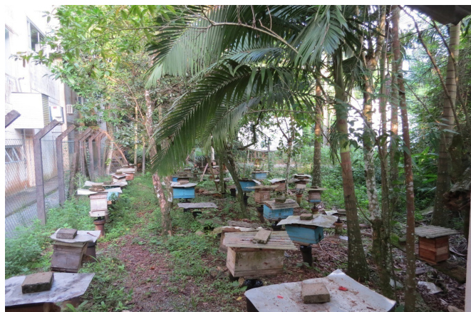
Figure 1. Meliponary of the Regional University of Blumenau (mRUB).

acquired from beekeepers from Vale do Itajaí region, in the Santa Catarina state, Brazil and maintained currently at the meliponary of the Regional University of Blumenau (mRUB) (Fig. 1) localized at 26° 54' 21.81" S 49° 04' 48.53" W (Fig.2). Colonies of M. quadrifasciata have been maintained at mRUB since 1998 and colonies of M. mondury since 2003. These hives were extracted directly from nature in geographically close cities and have not been artificially divided.