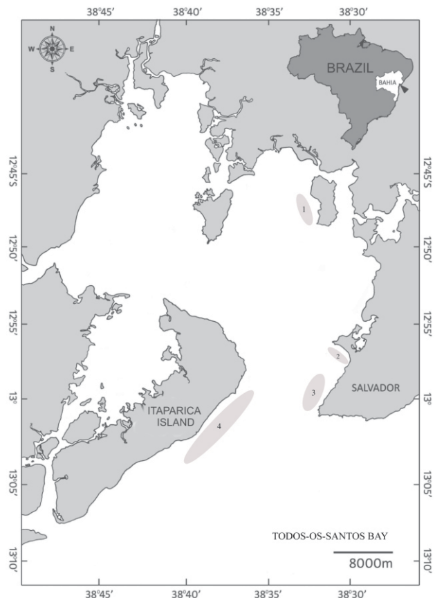
Figure 1. Map of Todos-os-Santos Bay showing the harvesting sites (shaded areas in the ocean): 1- coral reefs near Ilha dos Frades; 2- Mangueiras reef and Pedras Alvas reef; 3- coral reefs near Farol and Porto da Barra; and 4- Pinaúnas reef.

The questionnaires applied to the fishermen involved on this trade showed that most of them are men between 18 and