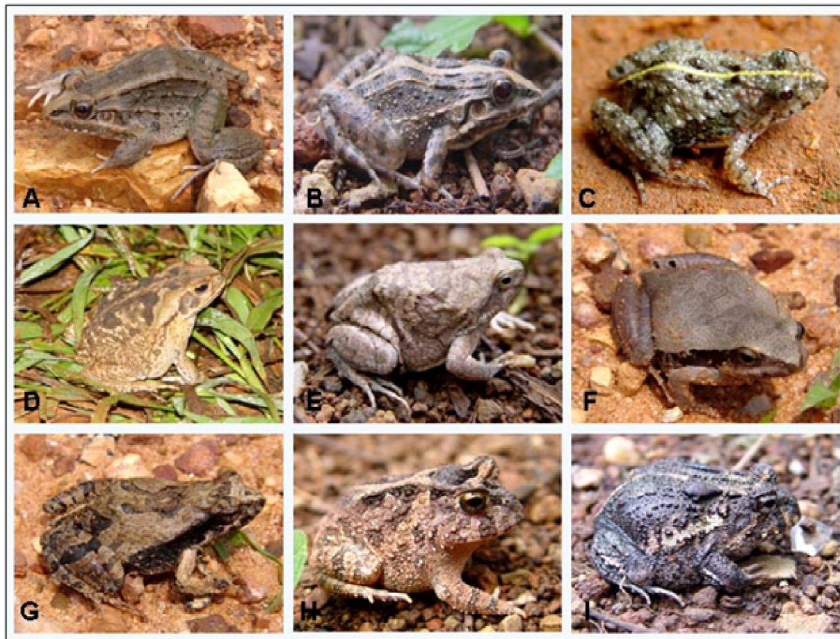
Fig. 3. A – Leptodactylus ocellatus, B – Leptodactylus fuscus, C – Pseudopaulidula saltica, D – Rhinella schneideri, E – Eupemphix nattereri, F – Physalaemus centralis, G – Physalaemus cuvieri, H – Proceratophrys cf. goyana and I – Odontophrynus cultripes.