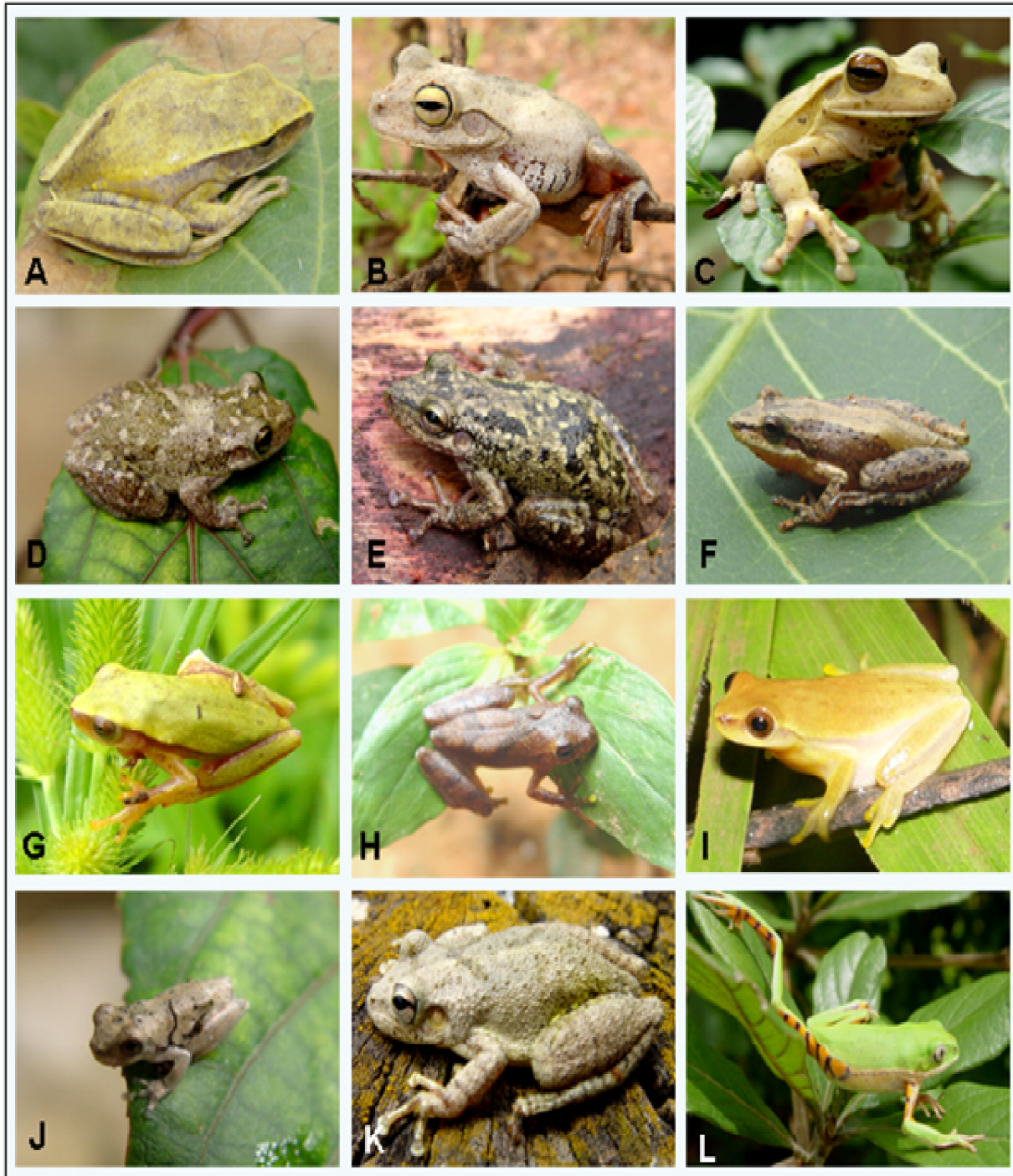
Fig. 4. A – Hypsiboas albopunctatus , B – Hypsiboas creptans , C – Hypsiboas raniceps , D – Scinax sp., E – Scinax fuscovarius , F – Scinax fuscomarginatus , G – Dendropsophus rubicundulus , H – Dendropsophus minutus , I – Dendropsophus nanus , J – Dendropsophus gr. microcephalus , K – Scinax ruber , L – Phyllomedusa azurea (Photos: José Roberto S. A. Leite).

The cluster analysis (Fig. 2) showed that anuran compositions of Terra Ronca State Park (present study) and northwestern São Paulo State were most similar, and that from Ouro Preto (Minas Gerais State) the most different. The region of Ouro Preto is composed by a mix of Atlantic Forest and Cerrado, which could lead to the presence of