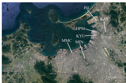
Fig 1. Map of the study sites in Fukuoka City, western Japan. ISL, Island-City Central Park; KAS, Kashi-Gu Shrine; HPM, Hakozaki Port Memorial Park; KYU, Kyushu University Hakozaki Campus; MMC, Momochi Central Park; MIN, Minami Park.

The studied urban areas are located in Fukuoka City, in the western part of Japan (Fig 1). The elevation at the sites ranges from 5 to 61 m a.s.l. The mean annual temperature